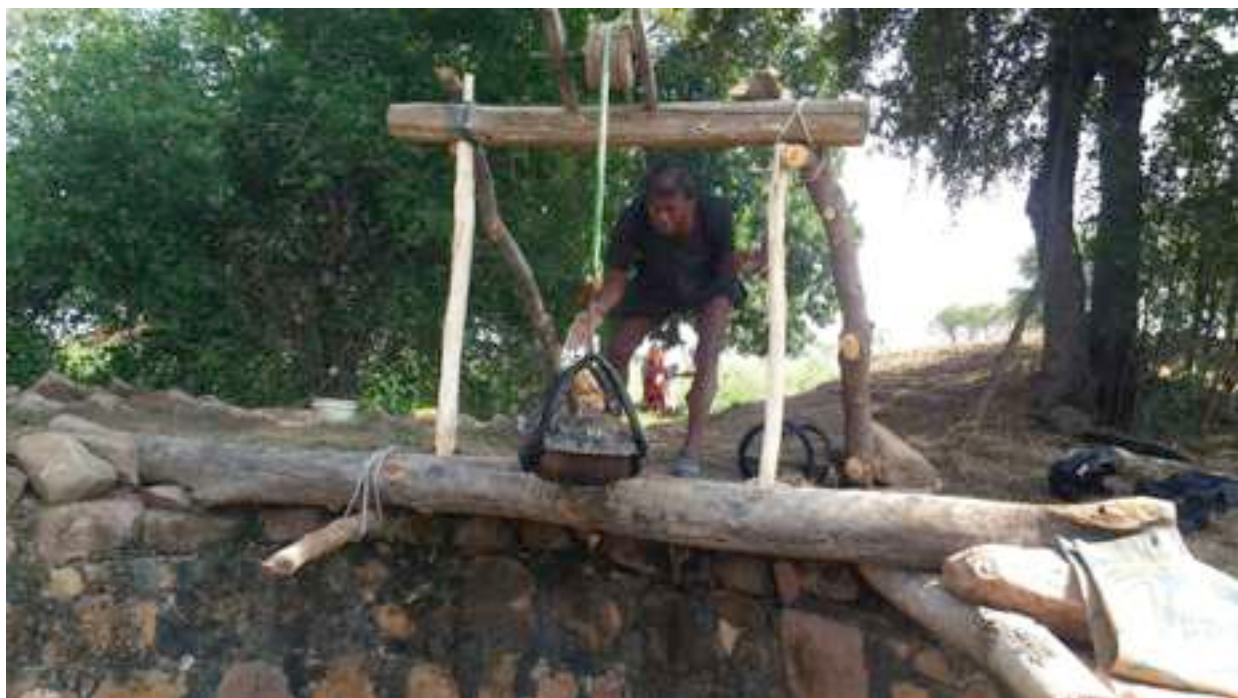
Figure 7 Well deepening in progress