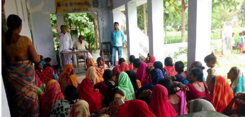
Figure 3 Parent teacher meeting in progress