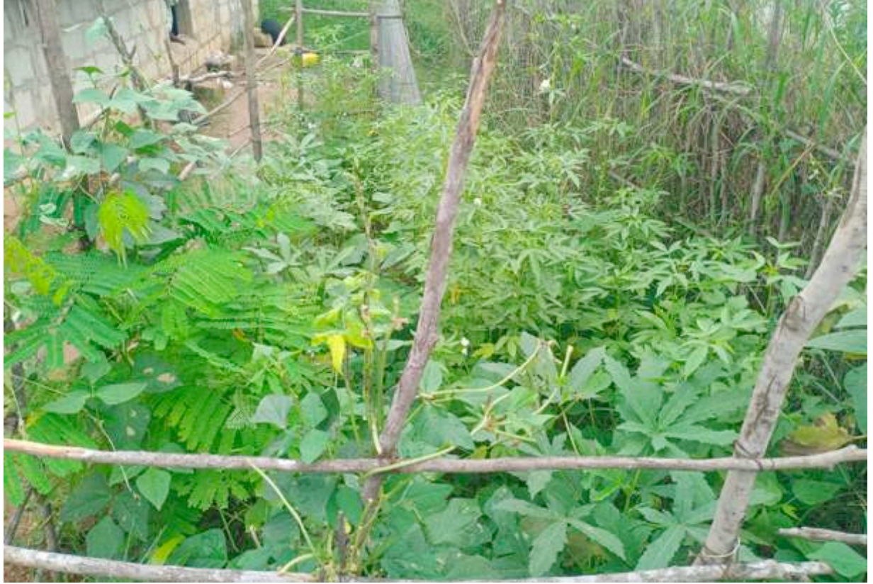
Images of kitchen gardens in Jj Nagar