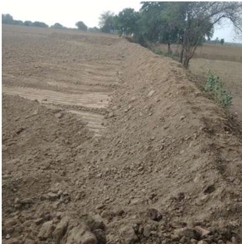
Figure 6 Recently created farm bund

Subsequent to a meeting with the farmers held on 5 March, 2021, the land on which bunding was to be undertaken, was divided into 2 clusters belonging to 15 farmers each. As work began, the panchayat also showed interest in supporting the expansion of this activity and finally bunding was completed on a total of 110 acres of farmland. The farm owners contributed 10% of the work in the form of shramdaan (voluntary labour). It must be noted that unlike the original plan of the entire work being undertaken manually, COVID restrictions compelled the use of the JCB for some part of the work.