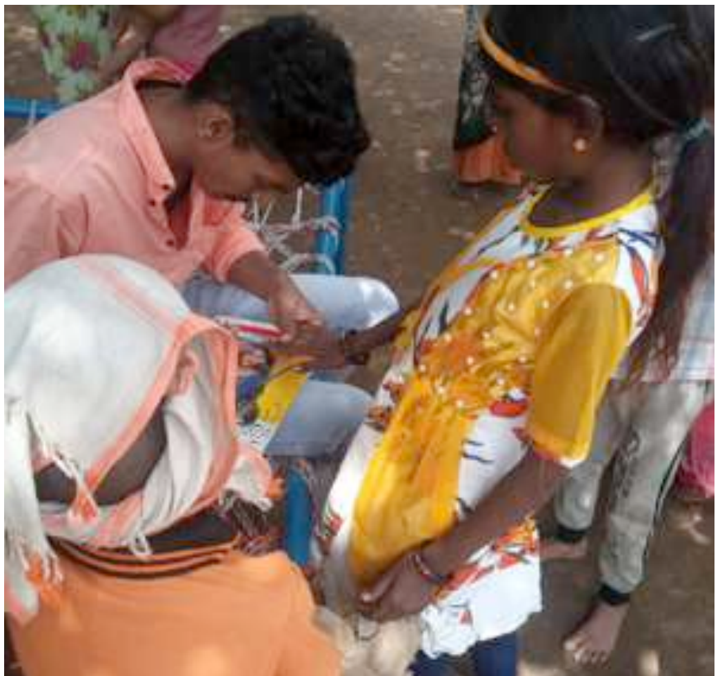
Figure 8 Nail cutting

The Swasthya Saathis are based in the communities with whom they work. They began their work by interacting with children through games and music at first and then talked about sanitation and hand hygiene. The Saathis have also begun identifying children who are in need of therapeutic nutrition and are each, in their own geographies, devising means by which it can be made available. Child malnutrition is of serious concern in all the three districts.