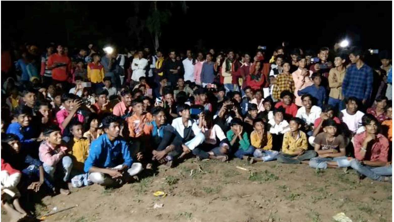
Figure 5. Audiences everywhere were attentive and engaged

The messages of basic health reached about 10,000 men, women and children in 95 villages and hamlets.