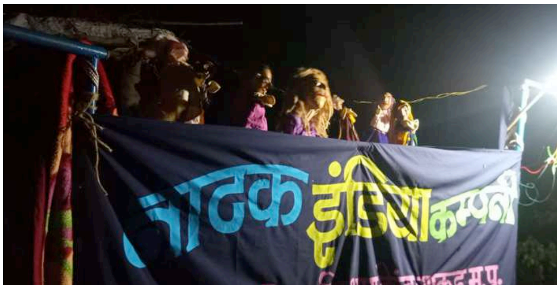
Figure 4. An evening puppet show in Madhya Pradesh

The play was performed in Bareli and Marwari and addressed the themes of cleanliness, good diet and nutrition. It discussed the importance of availing of government health schemes and using government health infrastructure. The play also communicated the importance of the COVID-19 vaccination. As the dialogues were in the local language and the scenes were based on real life situations, the audience was able to identify with the play. The play incorporated humour which helped captivate the audience and communicate the messages more effectively.