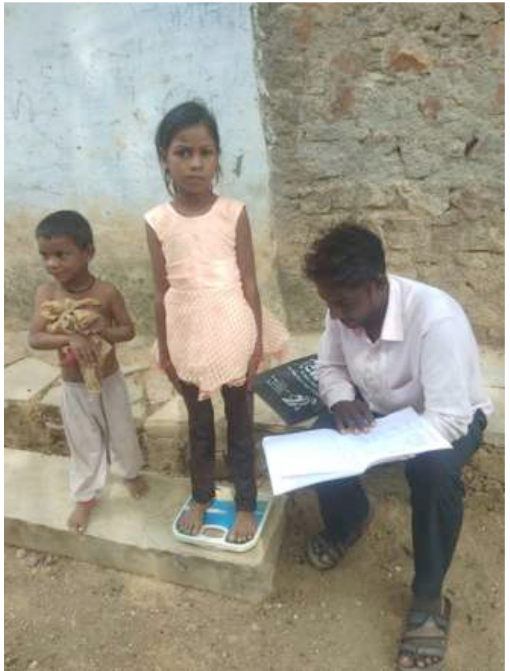
Figure 9 Weighing machine